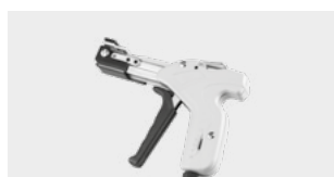
STEEL TIE CRIMPER